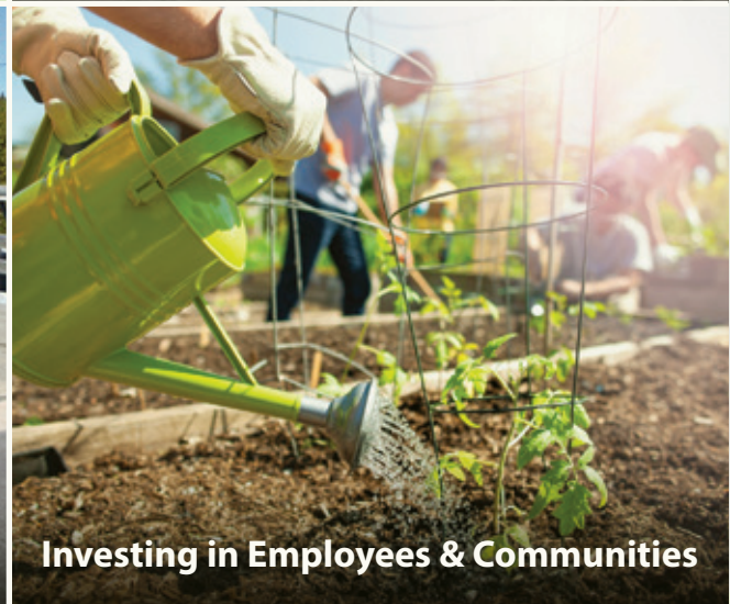
Investing in Employees & Communities