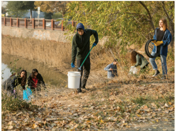
Supporting our communities: We are proud to support our local communities in a variety of ways.