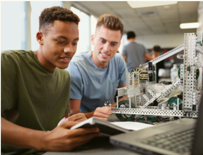
Engaging with education: We do this through scholarships, co-op placements, grad students, research projects and more.