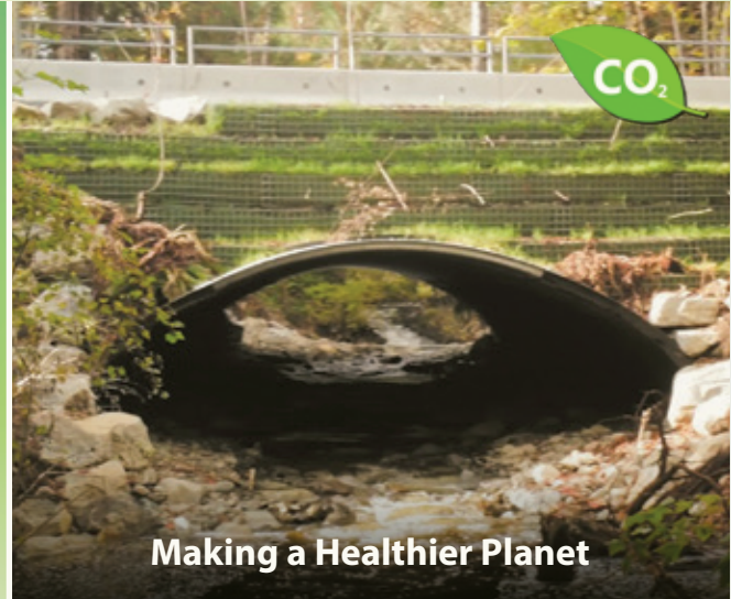
Making a Healthier Planet

Sustainability is integral to our business. Plus, it's the right thing to do.